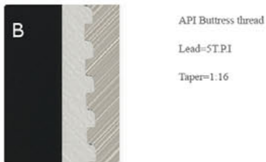
API Buttress thread Lead=5TPI Taper=1:16